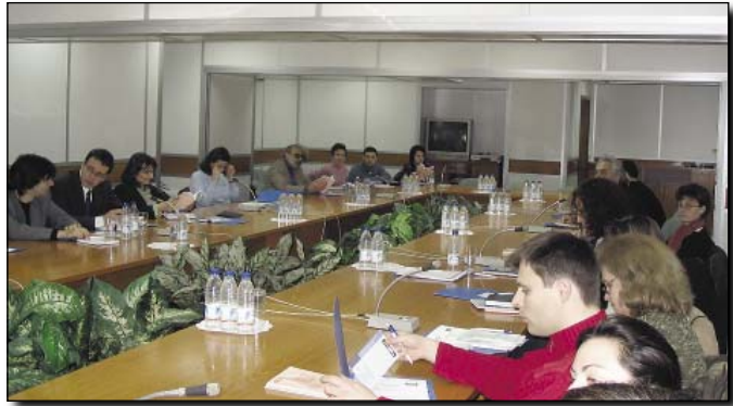
BCNL seminar “NGOs and the Public Procurement”, October 2005

Another area of activity was researching the possibility for non-profit organizations to participate in public procurement bids. An analysis was developed and published on the legal requirements of public procurement