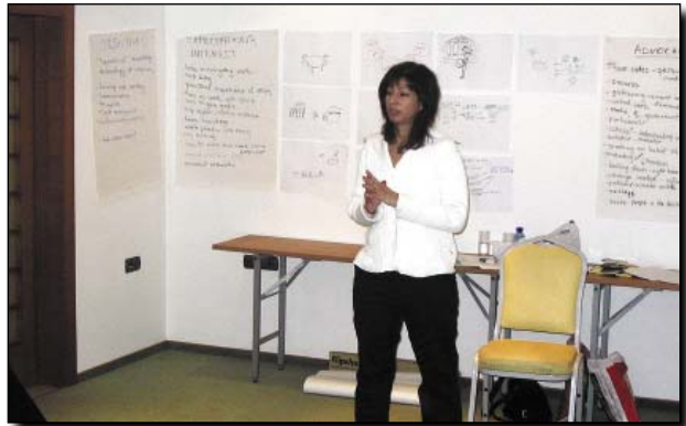
Training on advocacy for NGOs, grantees of the Judicial Strengthening Initiative, December 2005

tives of legal NPOs – in order to analyze and summarize the key priorities for legislative reform. On the basis of the survey, a team of BCNL experts made an analysis where the main proposals of the professional community for reforms of the judiciary were outlined. A series of