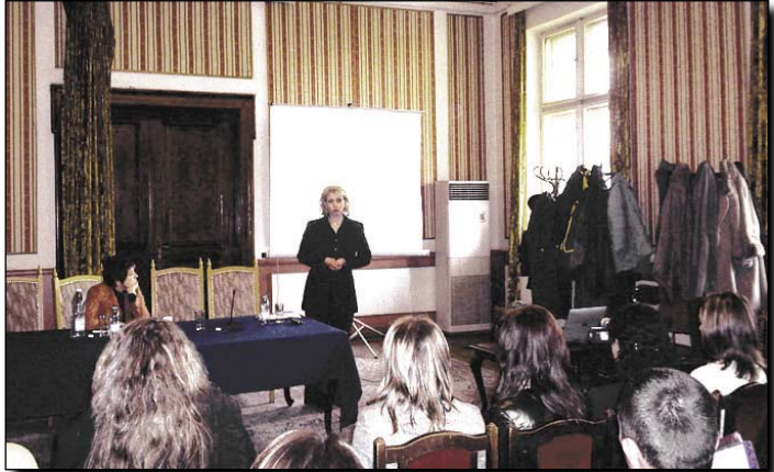
Discussion of the problems of Social Enterprises, March 2005

for the development of social enterprises and creating a mechanism for quality control in the provision of social services.