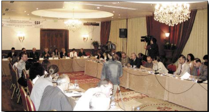
Public discussion of the legislative priorities of the political parties, concerning the judiciary, June 2005

One of the most important steps in the process of Bulgaria's accession to the EU is the reform in judiciary. The Bulgarian Center for Not-for-Profit Law is a partner of the Judicial Strengthening Initiative. An important part of this cooperation is organizing public forums with representatives of the state and civil society for discussing key priorities of judicial reform in Bulgaria. We organized a forum in June where political parties presented their views on the legislative priorities of the judiciary. We plan to continue this type of public discussions in 2006 as well.