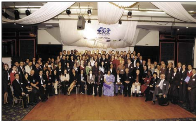
Global Forum on Civil Society Law, Istanbul, November 2005

and was publicized in a series of public events and meetings. As a result the Concept Paper was supported by over 400 organizations from all over the country and will serve as a basis for specific steps aimed at improving NPO legislation in 2006.