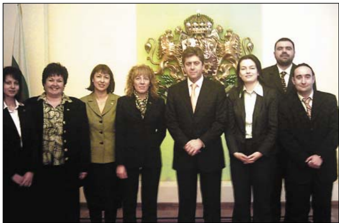
Meeting of representatives of voluntary organizations with the President of Bulgaria, December 2005

of Bulgaria, Mr. Georgi Parvanov, which took place in the beginning of December to mark the International Volunteer Day – 5 December. The President expressed his willingness to support a future initiative for passing an adequate legal framework on the