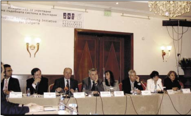
Public discussion of the legislative priorities of the political parties, concerning the judiciary, June 2005

BCNL was actively involved in the project through several initiatives. A discussion was organized in June with representatives of the main political groups and magistrates, scholars and representatives of legal NPOs. There